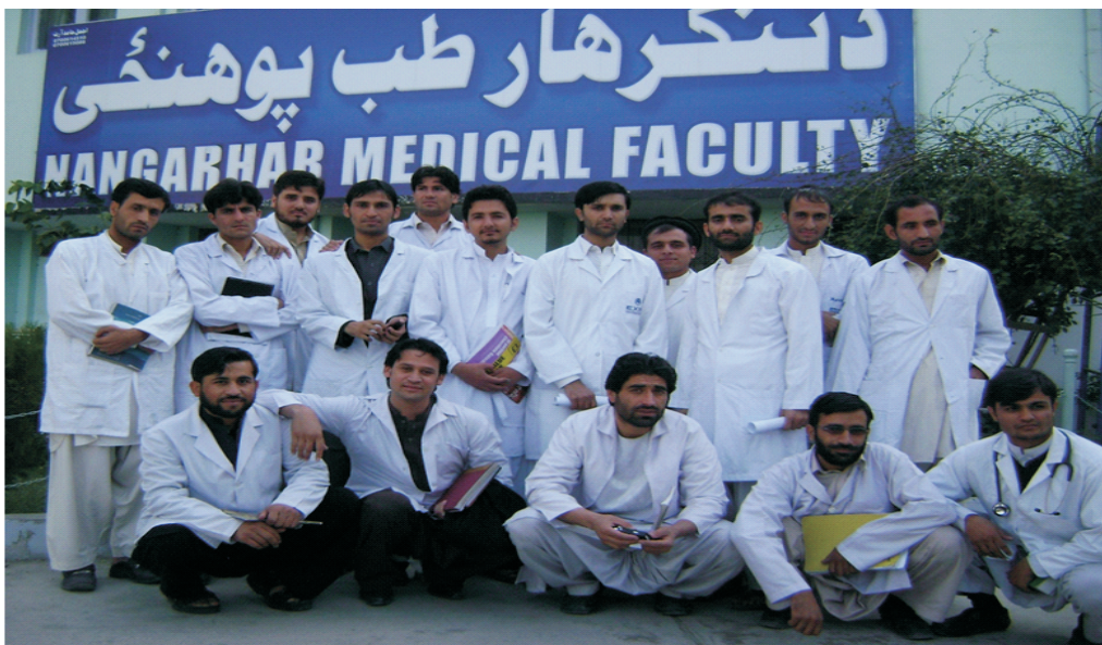
د ننگرهار د طب پوهنځی د پنځم صنف محصلین، ۱۳۹۰