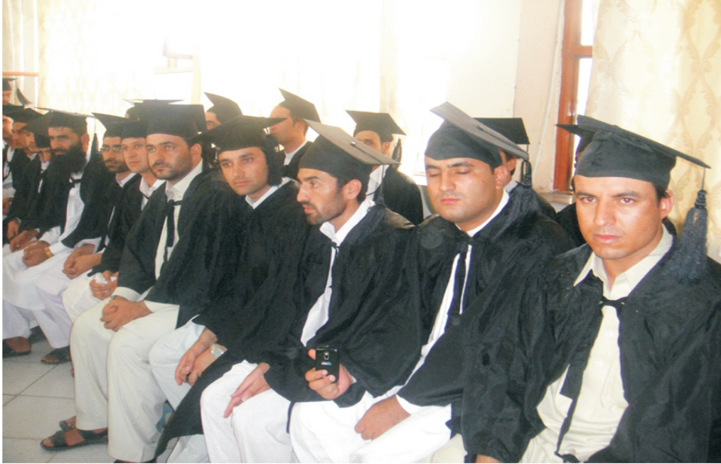
د ننگرهار د طب پوهنځی د محصلینو د فراغت مراسم، ۱۳۹۰