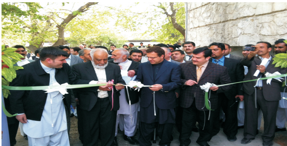
د ننگرهار پوهنتون د نوی لیبی د افتتاح مراسم