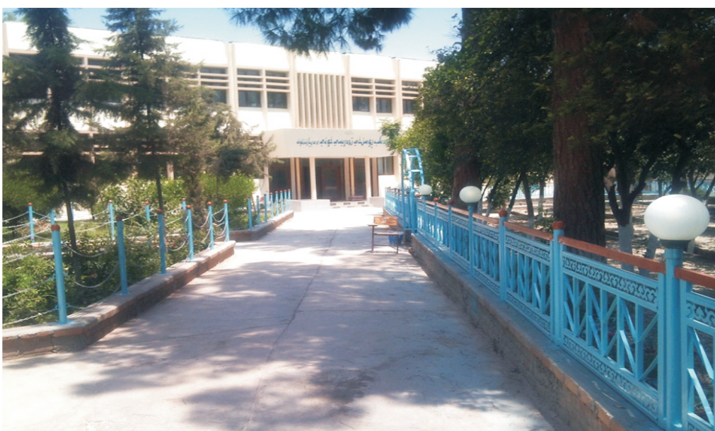
د ننگرهار د طب پوهنځی تدریسي خونې، ۱۳۹۲